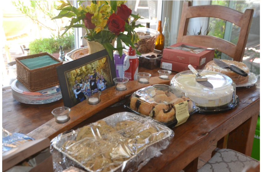
A Small Sample of the Desserts