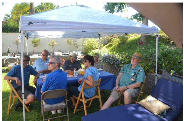
Members Enjoying the