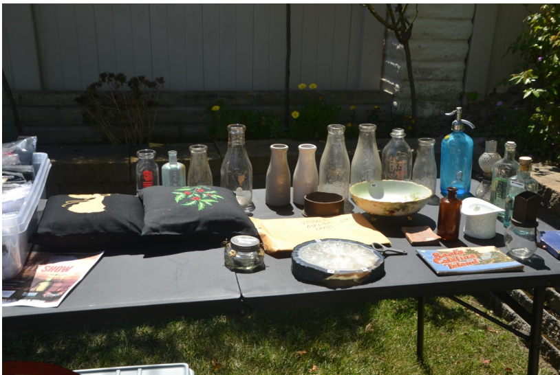
For Sale Tables