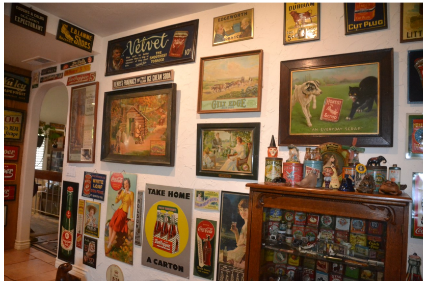
Some of Tim's Fabulous Collection of Signs