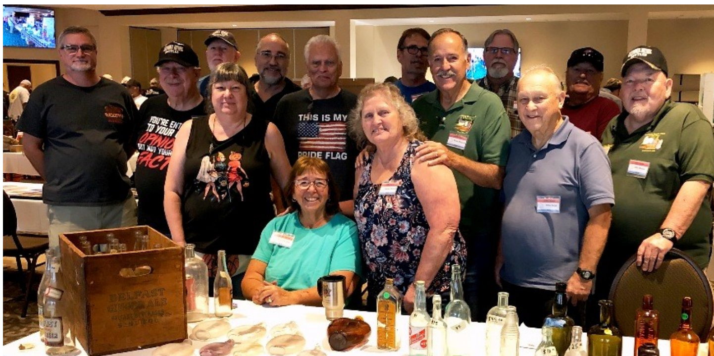
A Great Turn-out of San Diego Sellers and Buyers at the Los Angeles Bottle Show in September 2023