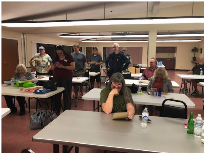
You Must Stand When You Only Need One Number